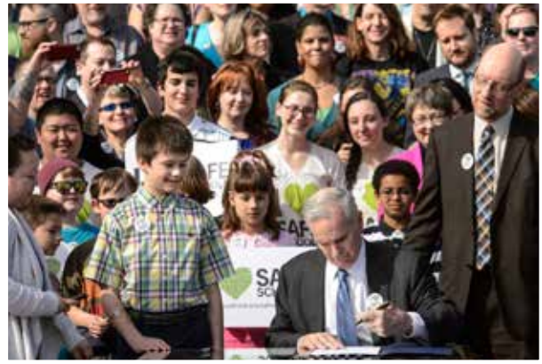
April 9, 2014 - Governor Mark Dayton signs the Safe and Supportive Schools Act.